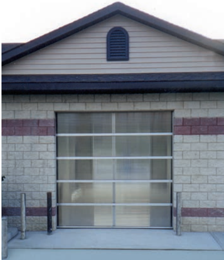
Survivor™ Polycarbonate Doors